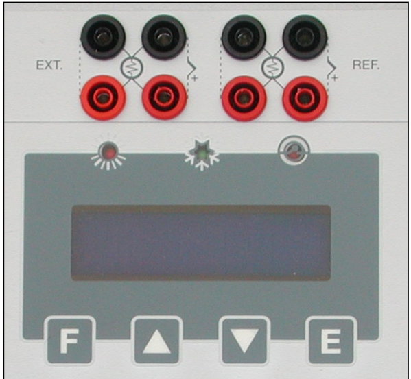
FLUID LEVEL ADAPTER